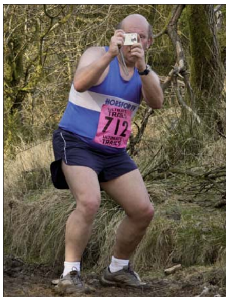
Say 'Cheese!' Or 'Sticky Toffee Pudding'! A Fat Bloke snaps the race photographer on the 16K multi terrain race.

Apologies though to anybody missed out, mistimed or misquoted. Let me know and I will correct or redress the balance in the next issue.