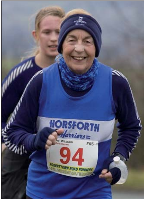
Hils pictured at the Liversedge Half Marathon.

And, for the very last time, (as ladies captain anyway) Marie writes: