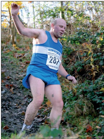
(In hushed David Attenborough-esque tones) "Here, lumbering through the dense undergrowth, a rare sighting of the Greater Newsletter Editor, a shy, retiring creature rarely seen in the open..."

And that's your lot until next year. If I've missed out any race, performance, time, PB or other notable event, let me know and I'll redress the balance next time out in 2010. Until then Merry Christmas and Best Wishes for a Happy and Successful New Year. Thanks for putting up with this nonsense on a regular basis and to all those who have contributed during the past twelve months. To all those who have thanked me for my efforts in the past year, you're too kind, but ta ever so!