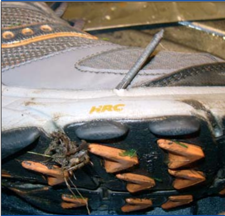
Photo above shows Ian Park's shoe after the last Vets GP race in 2008 with its