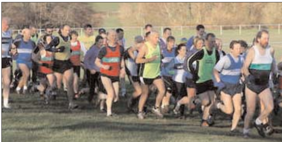
Spot the Harrier! The runners set off at the first Sport Direct XC race at Woodkirk, on what looks like a very dry part of the course...it didn't last for long!

The fourth fixture is a co-hosted event between ourselves and Kirkstall at Bramley Fall Woods on 18th February, where we not only need to field our strongest teams to maintain our challenge, but also need volunteers to marshal on the course.